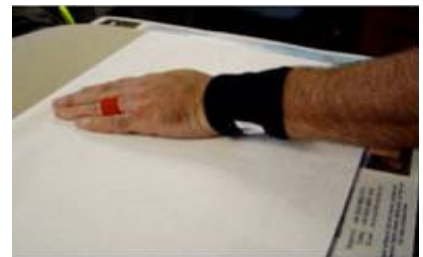
Example A: Watch & Ring Covers

Clean, high visibility, car friendly work wear should be issued and worn at all times within the compounds, docks, loading and discharge operations. All personnel, support staff and visitors should conform to this requirement when visiting operational areas. Admittance to storage or operational areas must be restricted to essential personnel at all times.