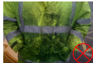
Example D: Ensure clean PPE