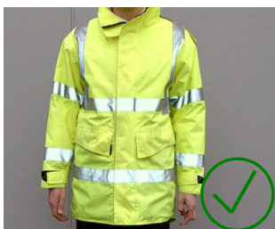
Example B: Clean and no exposed buttons

Clean, high visibility, car friendly work wear should be issued and worn at all times within the compounds, docks, loading and discharge operations. All personnel, support staff and visitors should conform to this requirement when visiting operational areas. Admittance to storage or operational areas must be restricted to essential personnel at all times.