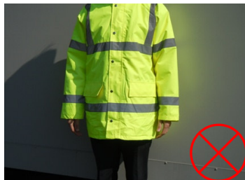
Example C: Exposed buttons